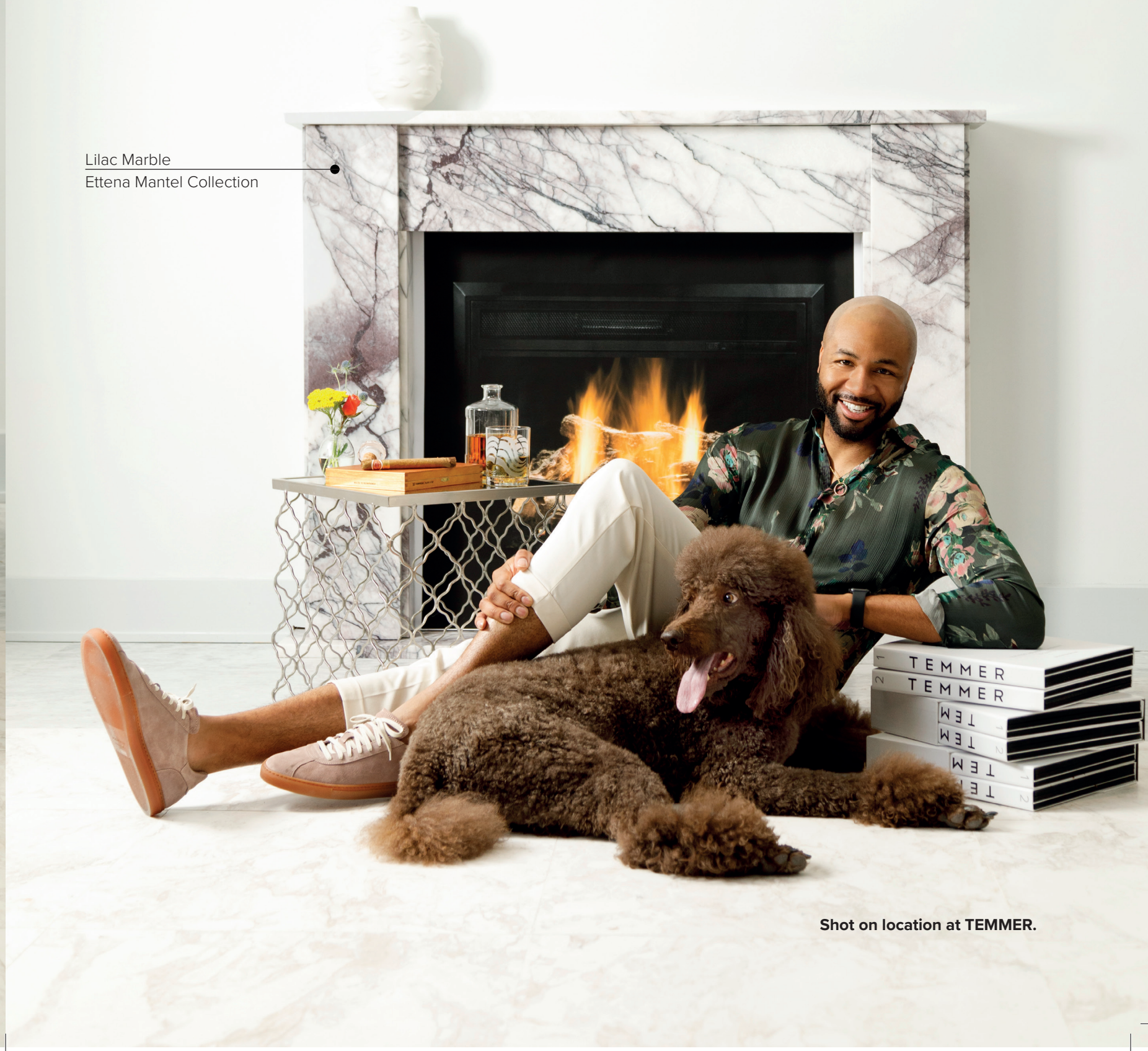
Shot on location at TEMMER.